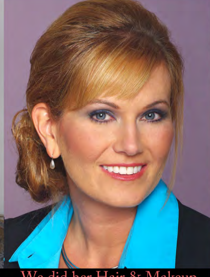
We did her Hair & Makeup