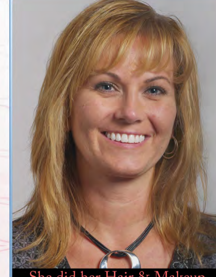
She did her Hair & Makeup

No worries we digitally enhance your image to perfection. Your first impression will be your best.